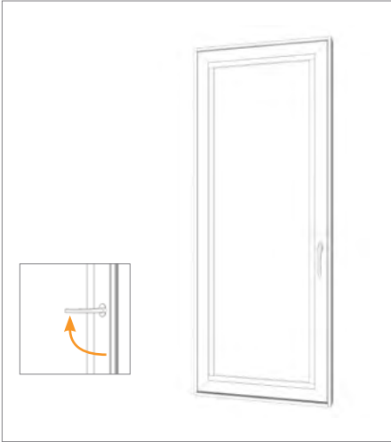
1. Turn handle up to horizontal.