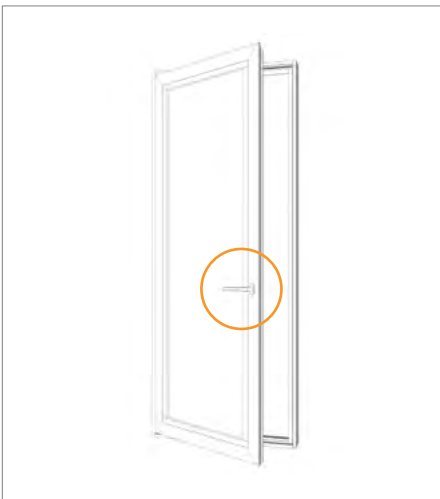
1. Ensure handle is at horizontal.