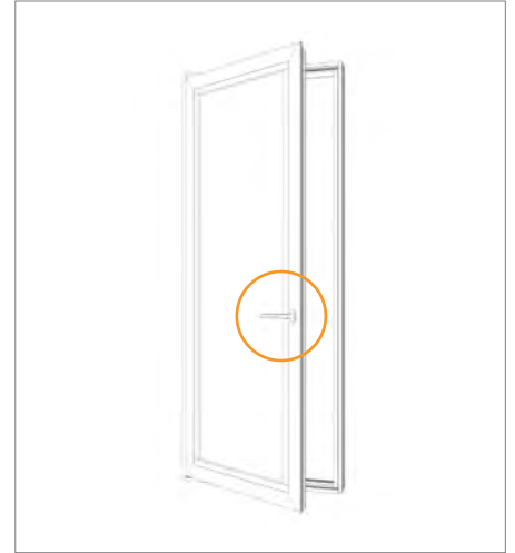
3. Leave handle at horizontal.