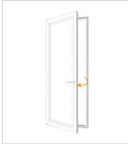
2. Gently pull door inward.