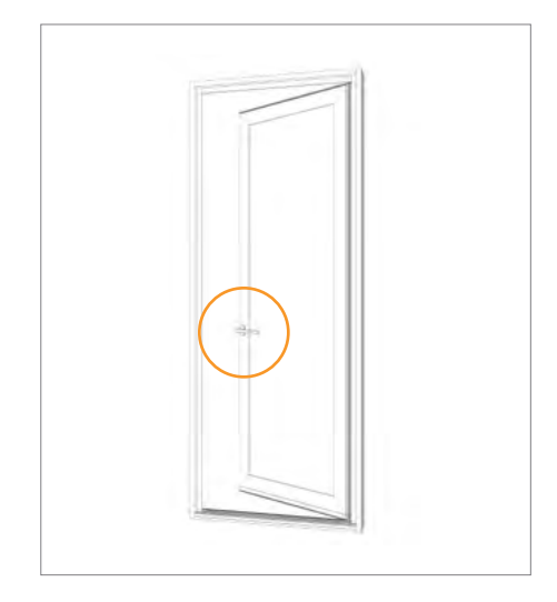
3. Leave handle at horizontal.