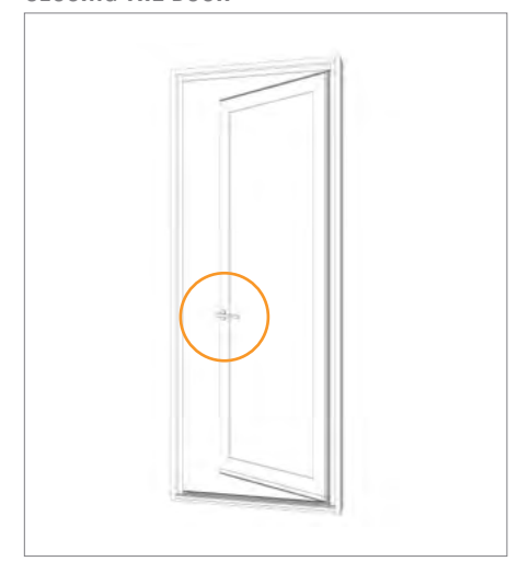
1. Ensure handle is at horizontal.