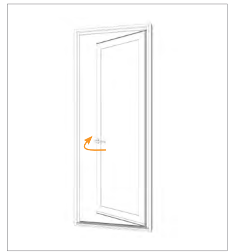
2. Gently push door outward.