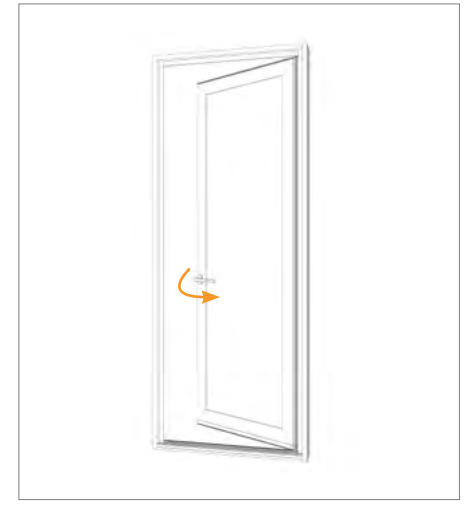
2. Gently pull door closed fully.