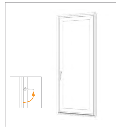
1. Turn handle up to horizontal.