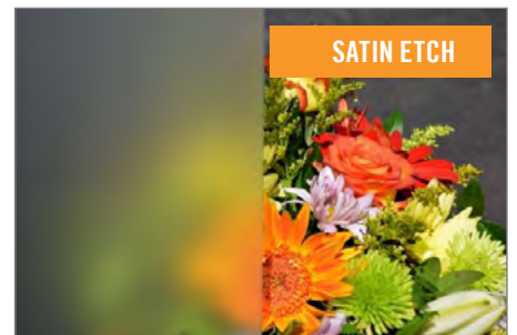
Sheet Size: 72" x 96" | Thickness: 3.9mm