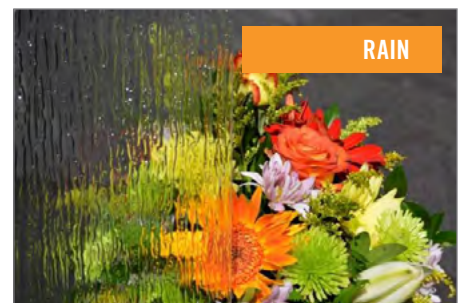
Sheet Size: 60" x 96" | Thickness: 3.9mm & 4.7mm