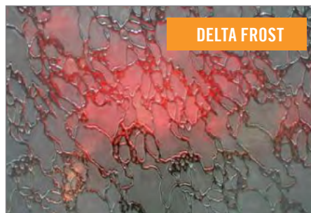
Sheet Size: 72" x 96" | Thickness: 3.9mm