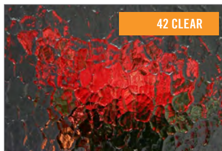
Sheet Size: 59" x 79" | Thickness: 3.9mm