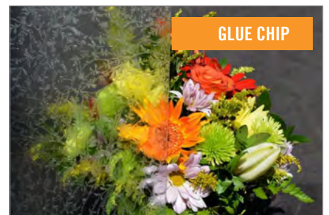
Sheet Size: 60" x 84" | Thickness: 4.7mm