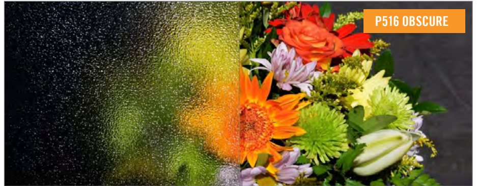
Sheet Size: 72" x 96" | Thickness: 4.7mm

For more information and glass options, please contact your Cascadia representative.