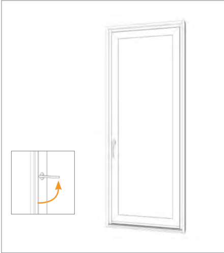
1. Turn handle up to horizontal.