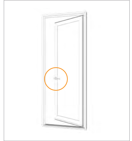
3. Leave handle at horizontal.