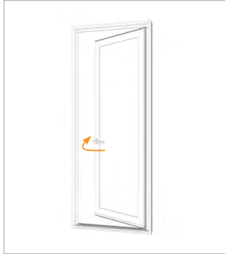
2. Gently push door outward.