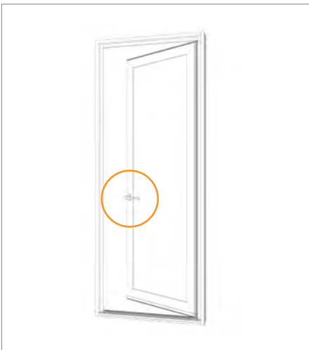
1. Ensure handle is at horizontal.